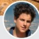
Bl Carlo Acutis