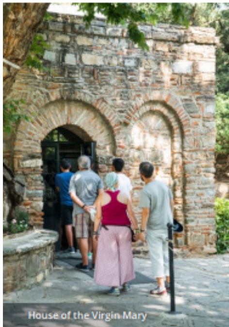
House of the Virgin Mary