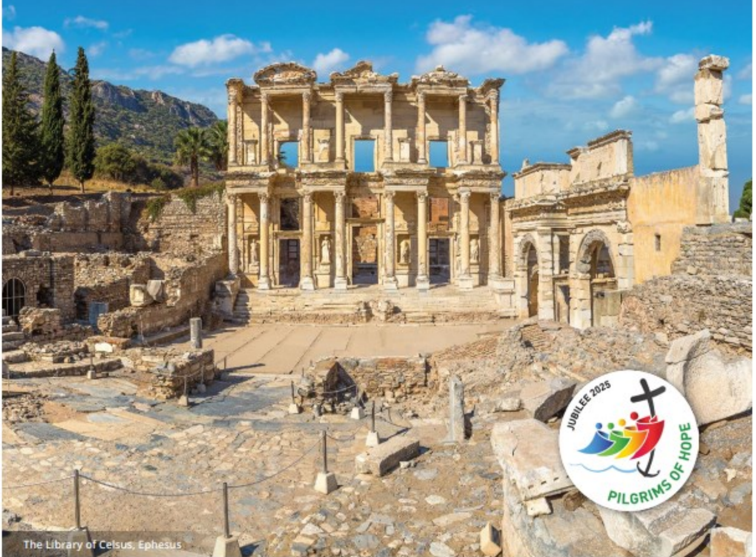
The Library of Celsus, Ephesus