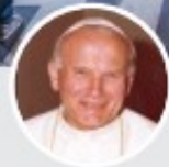
St John Paul II